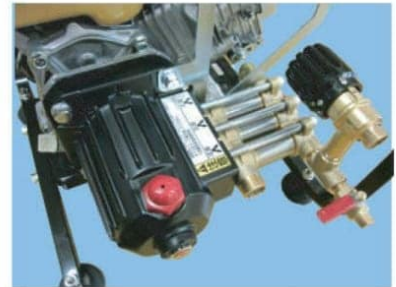
Complete with engine